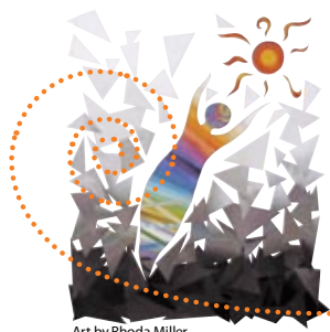
Art by Rhoda Miller

325 Stillman Hall • 1947 College Road • Columbus, OH 43210